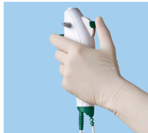
aScope™ 4 RhinoLaryngo Intervention is always comfortable to hold thanks to its lightweight and ergonomic design