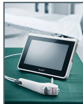
Ambu® aScope™ 3 Slim and Ambu® aView™